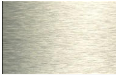
WI-446C Brushed Gold