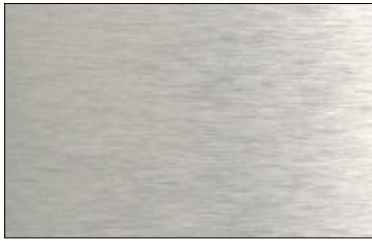
WI-106C Brushed Silver