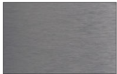
WI-070C Brushed Titanium Grey