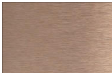
WI-271C Brushed Bronze Brown