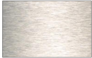
WI-903C Brushed Golden Bronze