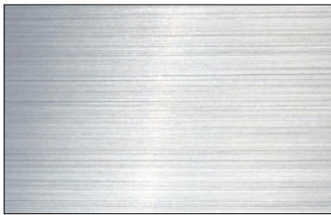
WI-103C Steel Look